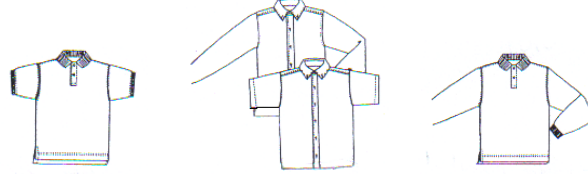
Logo Polo Shirt

(CCS will provide a one time opportunity for you to bring in current shirts that you own already to have them embroidered. This will be in the middle to late July in order to have them back before school begins in August. An email notice will go out with more details.)